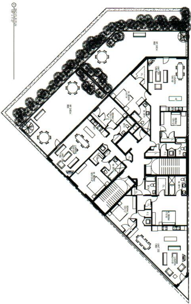
○ LINCOLN SEMINAR 1/8" = 1'-0"